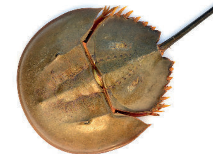
The blood of the prehistoric horseshoe crab is used to carry out the Limulus Amebocyte Lysate (LAL) test for detection and quantification of bacterial endotoxin.

“The use of low endotoxin products for cleaning and contamination control can help to minimise the risk of endotoxin contamination.”